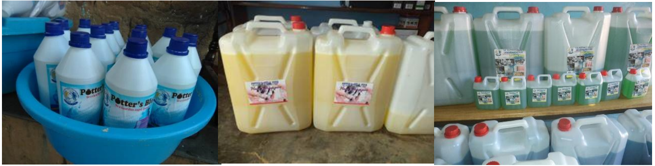
PHCF TRAINING IN PAPER BEADS (IGA)